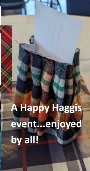
A Happy Haggis event...enjoyed by all!