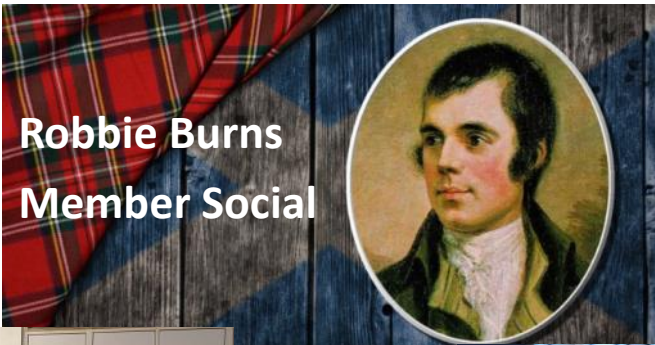
Robbie Burns Member Social